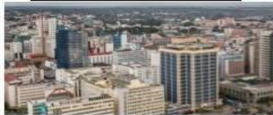
Nairobi is the capital city of Kenya

How does Nairobi compare with where I live?