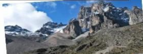
Mount Kenya (5200m) and the Tana River